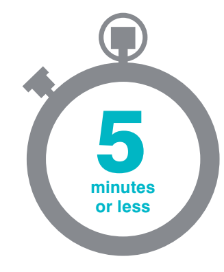
Results are ready